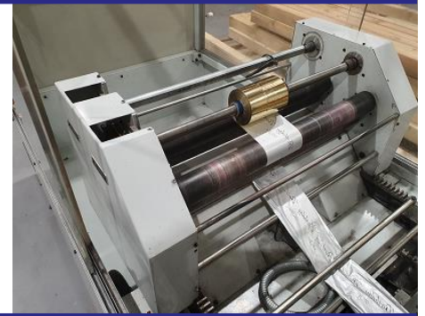
Plate Clamp Fixing Style Heated bed