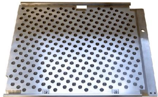
GTP 13 x 18 with SF Services Toggle Heater Plate And Foil Expert foiling conversion